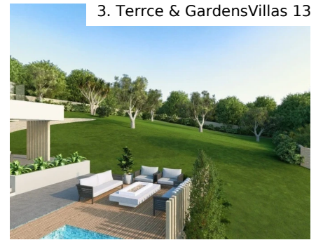
3. Terrace & Gardens