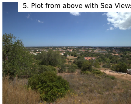
5. Plot from above with Sea Views