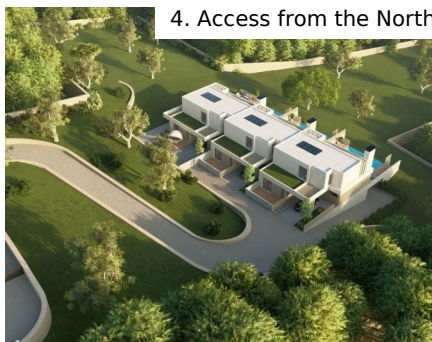
4. Access from the North