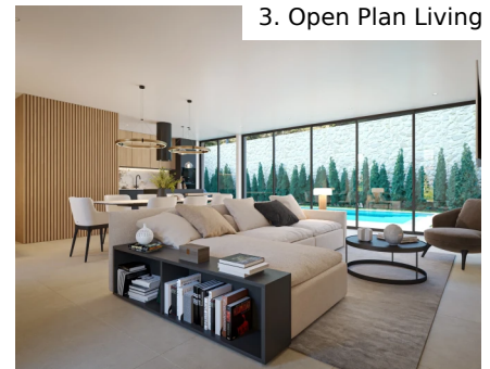
3. Open Plan Living