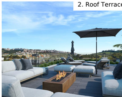
2. Roof Terrace