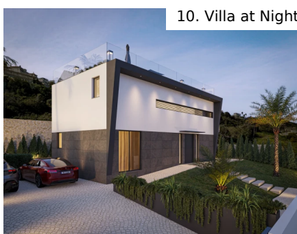
10. Villa at Night