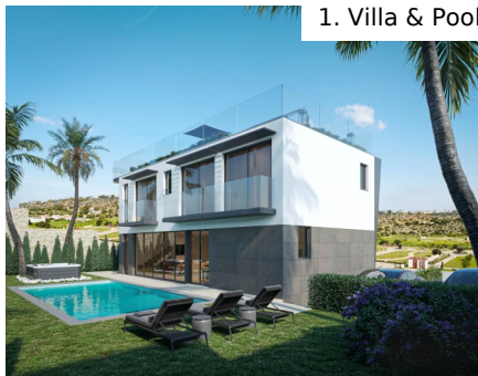
1. Villa & Pool