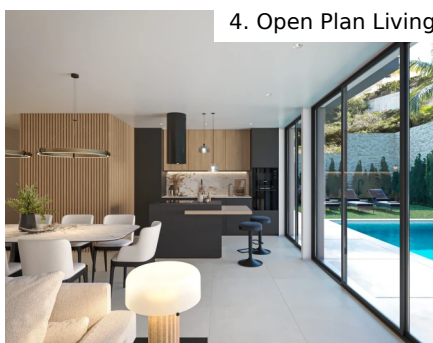
4. Open Plan Living