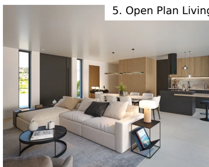
5. Open Plan Living