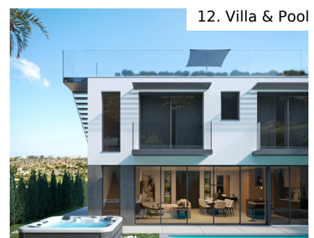
12. Villa & Pool