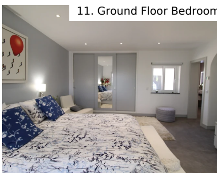
11. Ground Floor Bedroom