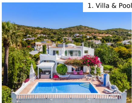
1. Villa & Pool