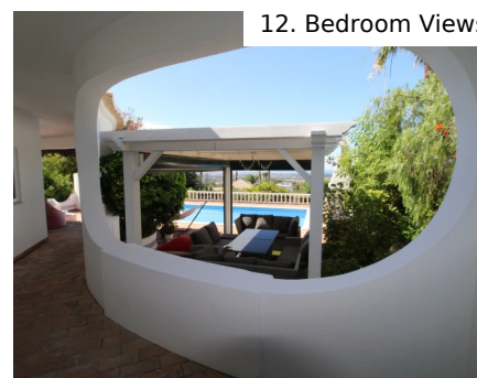
12. Bedroom Views