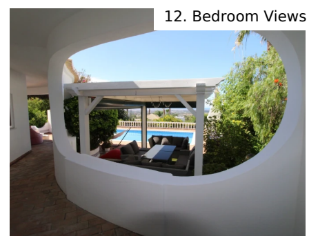
12. Bedroom Views