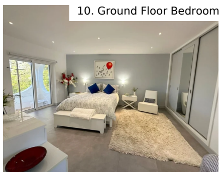
10. Ground Floor Bedroom