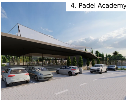
4. Padel Academy