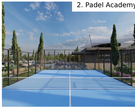
2. Padel Academy