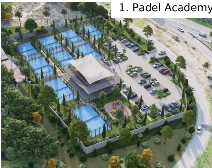
1. Padel Academy