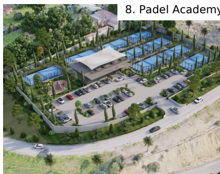
8. Padel Academy