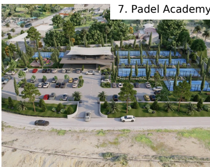
7. Padel Academy