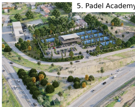
5. Padel Academy