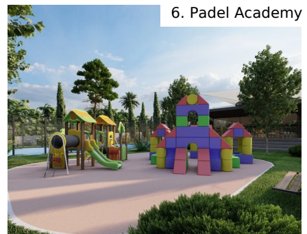
6. Padel Academy