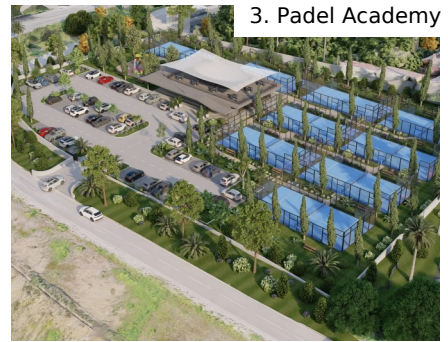
3. Padel Academy