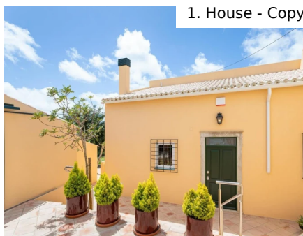
1. House - Copy