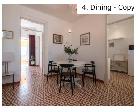
4. Dining - Copy