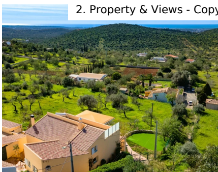
2. Property & Views - Copy