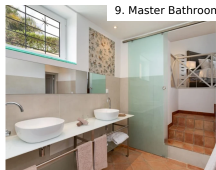
9. Master Bathroom