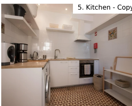
5. Kitchen - Copy