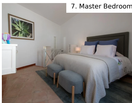
7. Master Bedroom