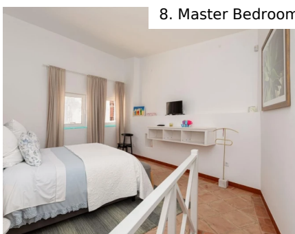
8. Master Bedroom