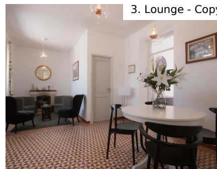
3. Lounge - Copy