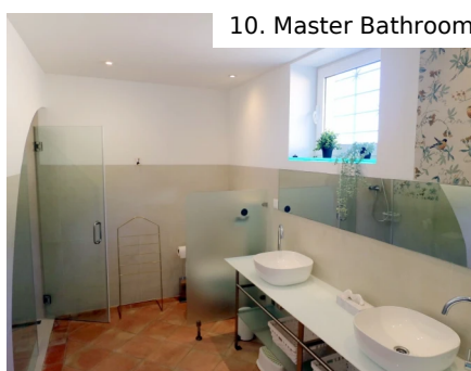
10. Master Bathroom