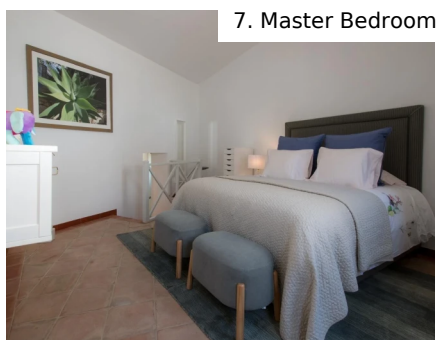
7. Master Bedroom