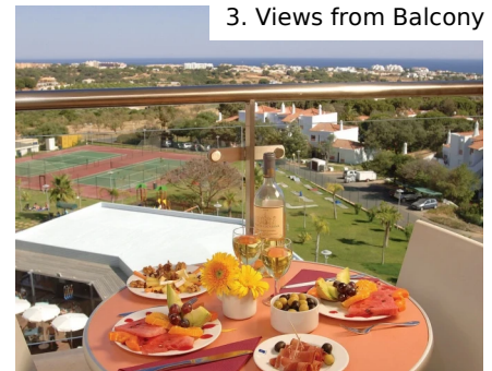
3. Views from Balcony