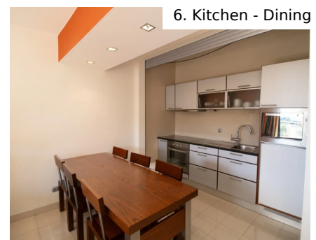
6. Kitchen - Dining