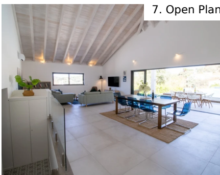
7. Open Plan