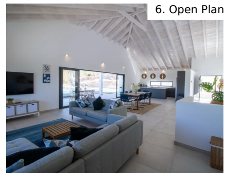
6. Open Plan