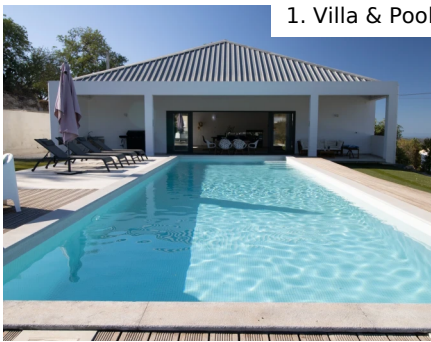
1. Villa & Pool