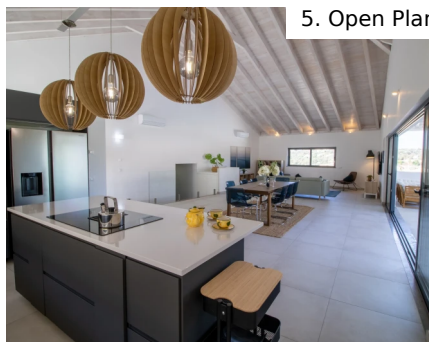
5. Open Plan