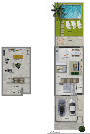
Floor plans BLK