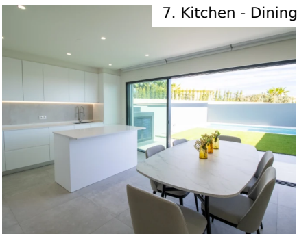
7. Kitchen - Dining