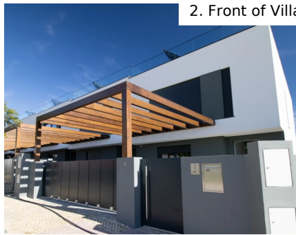
2. Front of Villa