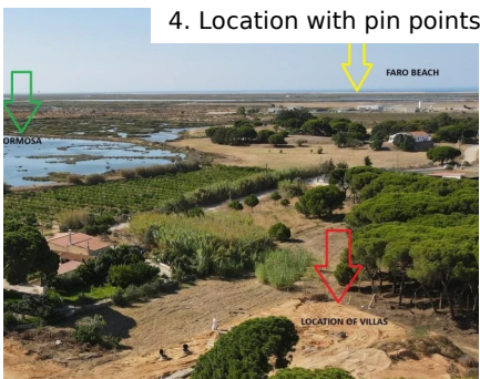
4. Location with pin points