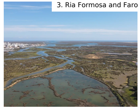
3. Ria Formosa and Faro