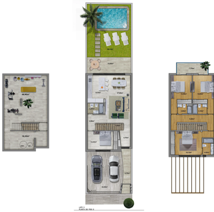
Floor plans BLK