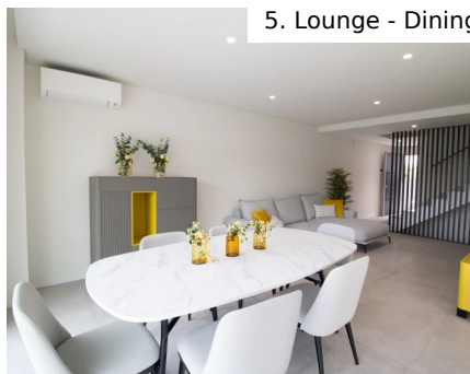
5. Lounge - Dining