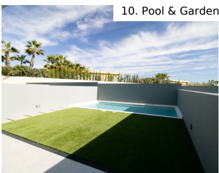
10. Pool & Garden