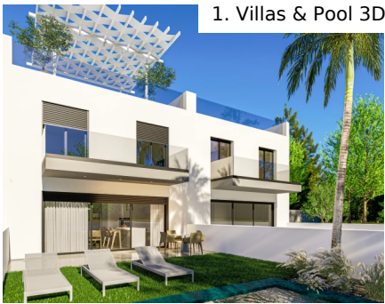
1. Villas & Pool 3D