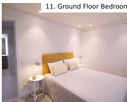
11. Ground Floor Bedroom