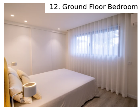
12. Ground Floor Bedroom