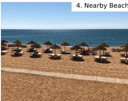
4. Nearby Beach