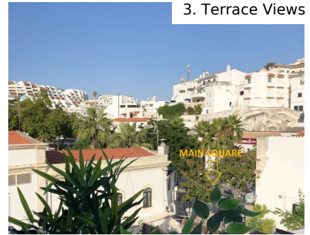
3. Terrace Views