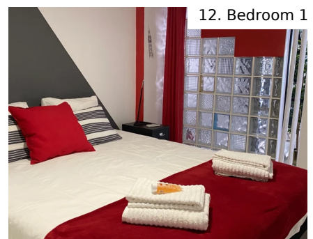
12. Bedroom 1