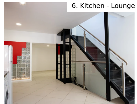
6. Kitchen - Lounge