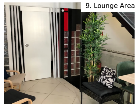
9. Lounge Area