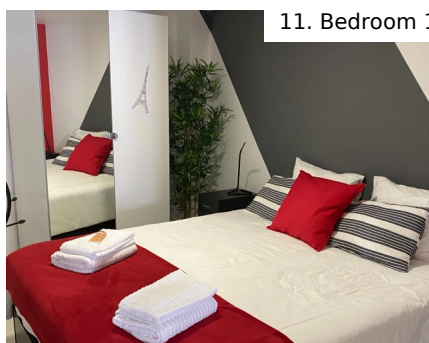
11. Bedroom 1