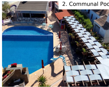
2. Communal Pool