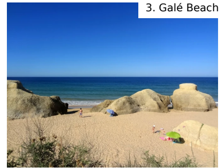
3. Galé Beach