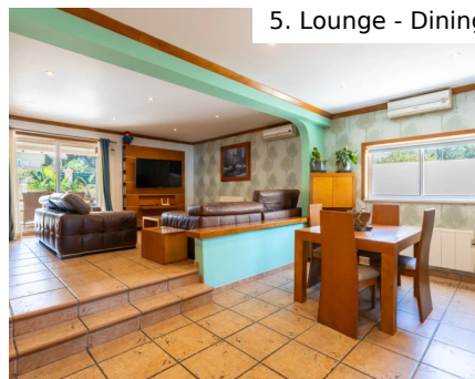
5. Lounge - Dining