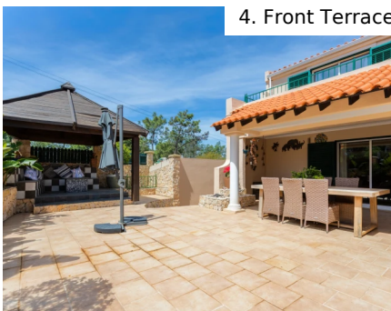
4. Front Terrace