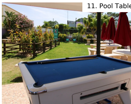
11. Pool Table