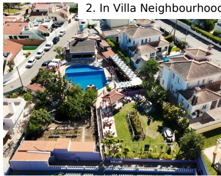
2. In Villa Neighbourhood