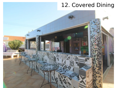
12. Covered Dining