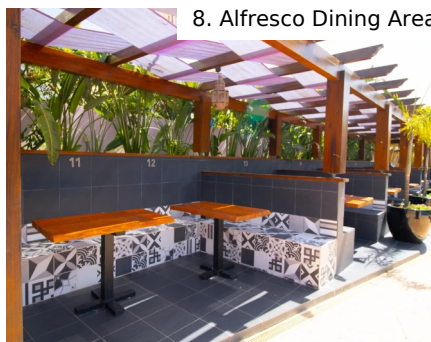
8. Alfresco Dining Area