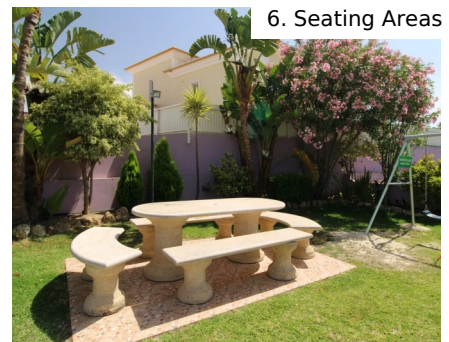
6. Seating Areas