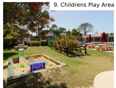
9. Childrens Play Area