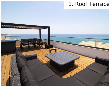
1. Roof Terrace