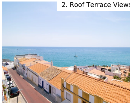
2. Roof Terrace Views