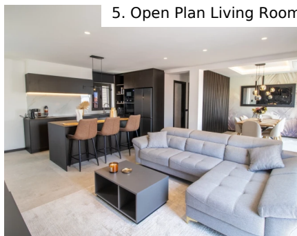
5. Open Plan Living Room