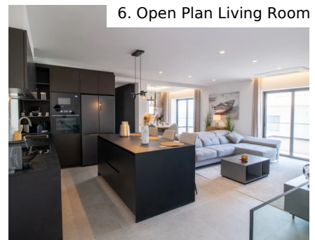
6. Open Plan Living Room