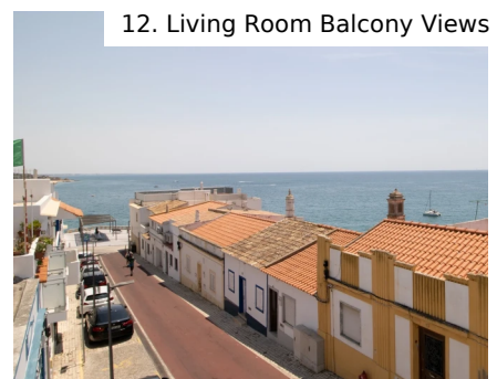
12. Living Room Balcony Views