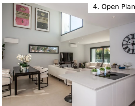
4. Open Plan