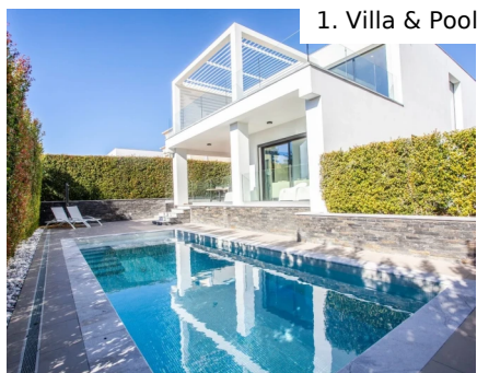
1. Villa & Pool