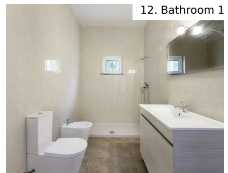
12. Bathroom 1