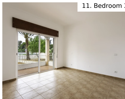
11. Bedroom 2