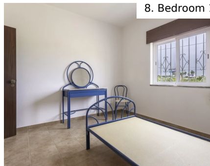
8. Bedroom 1