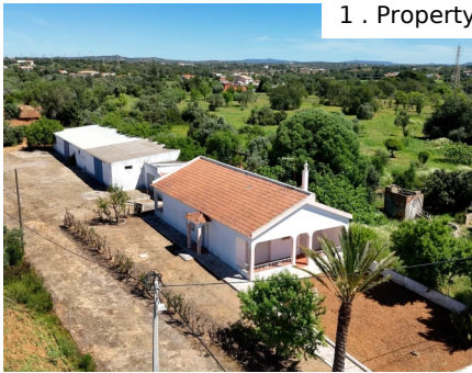
1 . Property