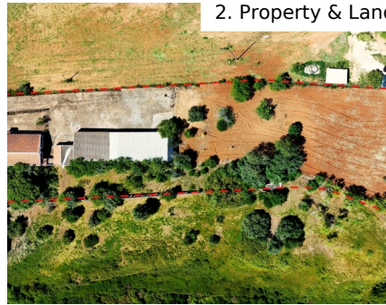
2. Property & Land