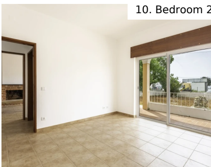
10. Bedroom 2