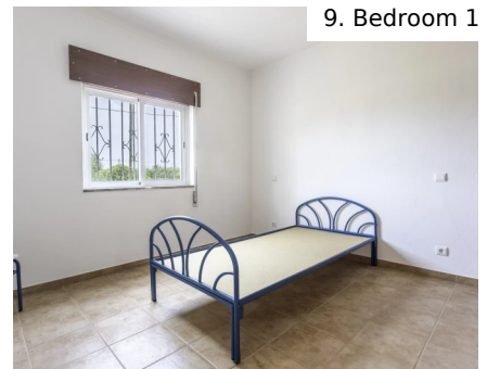
9. Bedroom 1