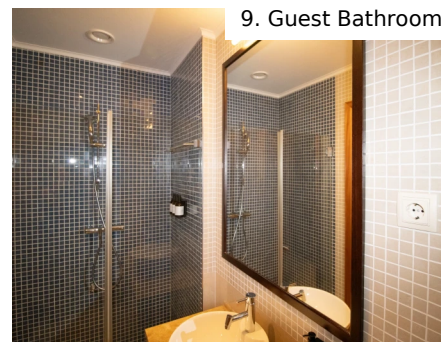
9. Guest Bathroom