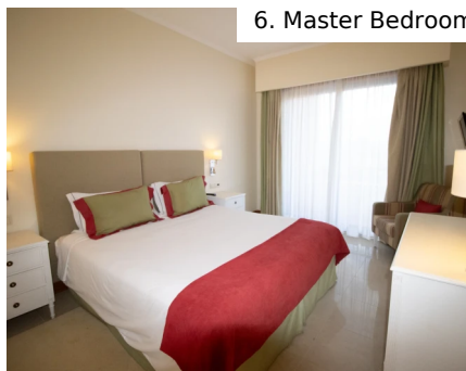
6. Master Bedroom