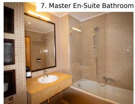
7. Master En-Suite Bathroom