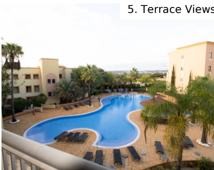
5. Terrace Views