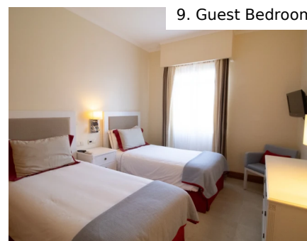
9. Guest Bedroom