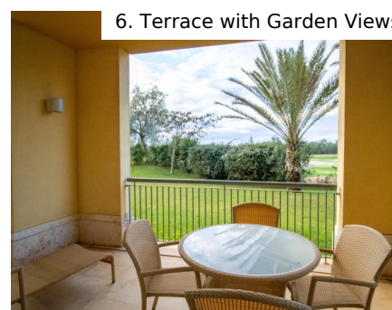
6. Terrace with Garden Views