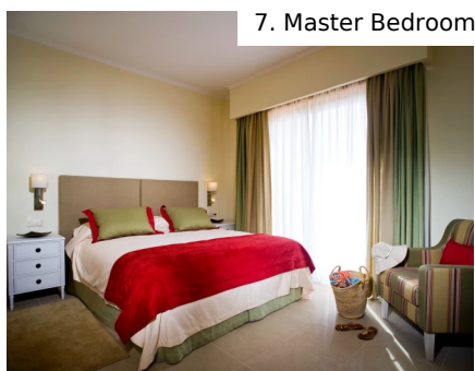
7. Master Bedroom