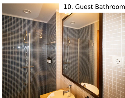
10. Guest Bathroom