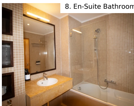
8. En-Suite Bathroom