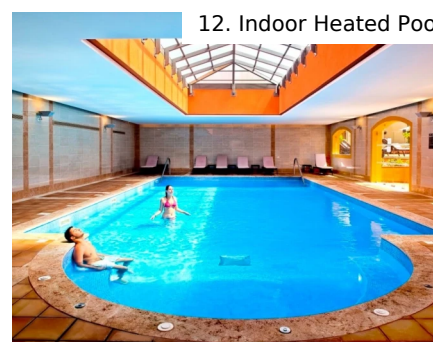
12. Indoor Heated Pool