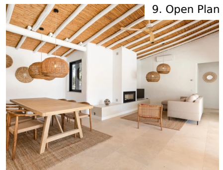
9. Open Plan