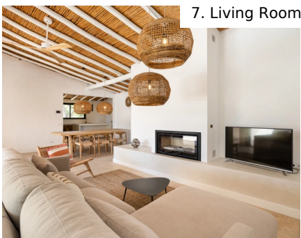
7. Living Room