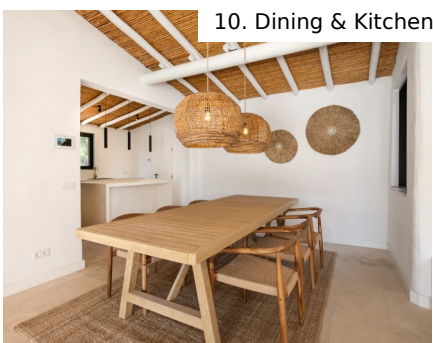
10. Dining & Kitchen