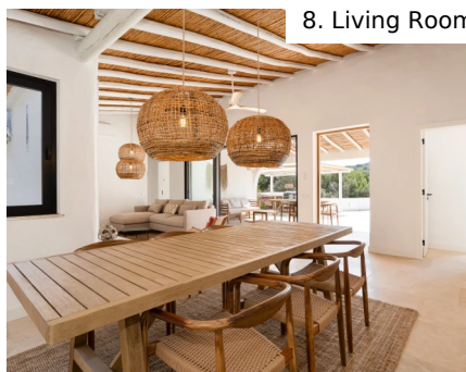
8. Living Room