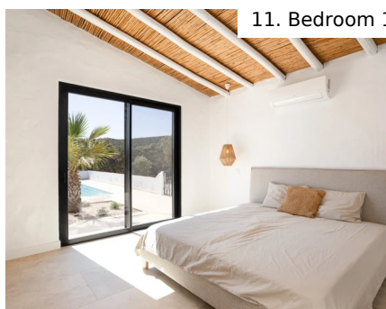
11. Bedroom 1