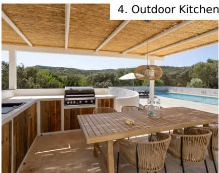
4. Outdoor Kitchen