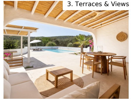
3. Terraces & Views