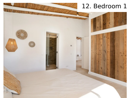
12. Bedroom 1