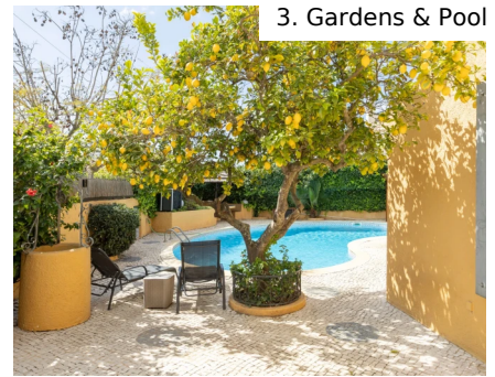
3. Gardens & Pool