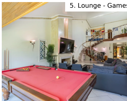
5. Lounge - Games