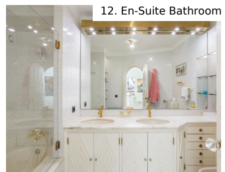
12. En-Suite Bathroom