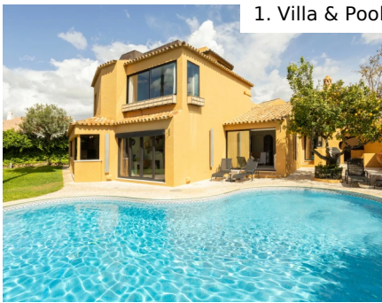
1. Villa & Pool