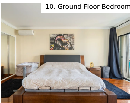
10. Ground Floor Bedroom