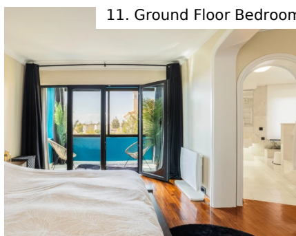
11. Ground Floor Bedroom